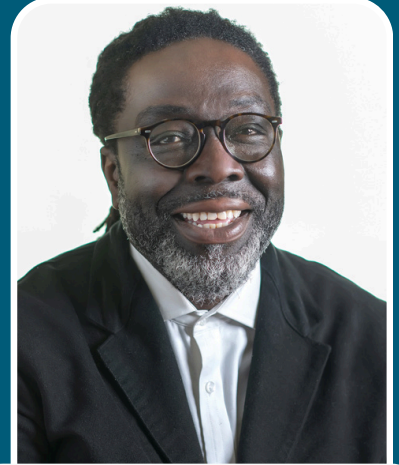
Lord Victor Adebowale CBE

Florence and Laura Norman Professor of Public Health and of African and African American Studies and of Sociology, Harvard University