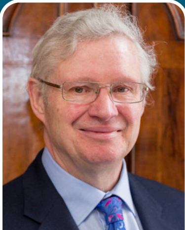
Lord Nigel Crisp

Independent crossbench member of the House of Lords