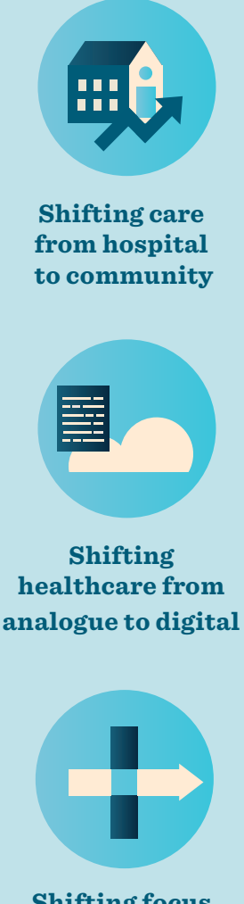
Shifting focus from sickness to prevention